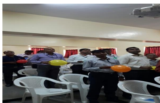
Group Activity during the FDP